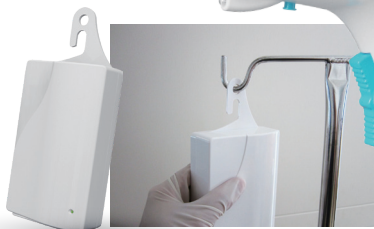
# 2500 AD - AC Adaptor