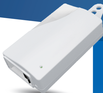
2500 ADG AC Adaptor